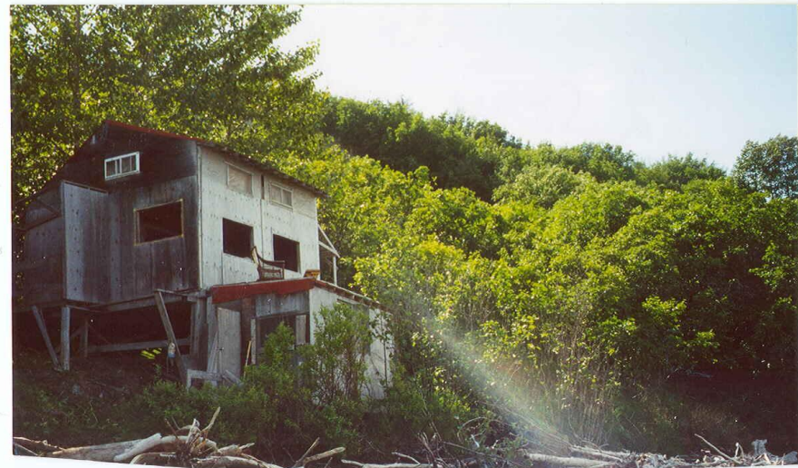
TWO STORY UPPER CABIN & LOWER GUEST SLEEPING CABIN W/DECK ON ROOF