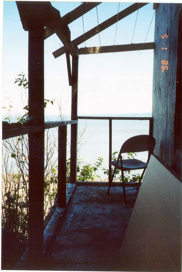
DECK OFF UPPER CABIN