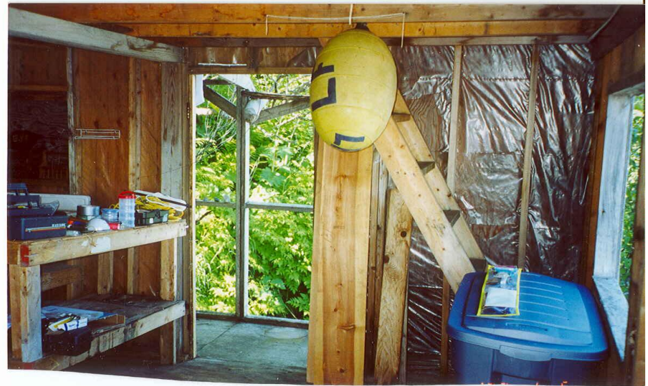
INSIDE UPPER CABIN