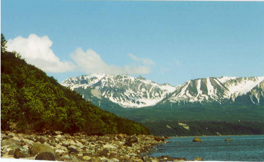
VIEWS TO WEST OF CHIGMIT MOUNTAINS