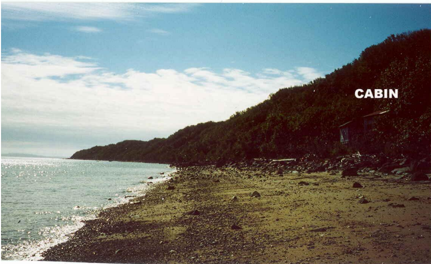
VIEWS TO THE EAST & HARRIET POINT