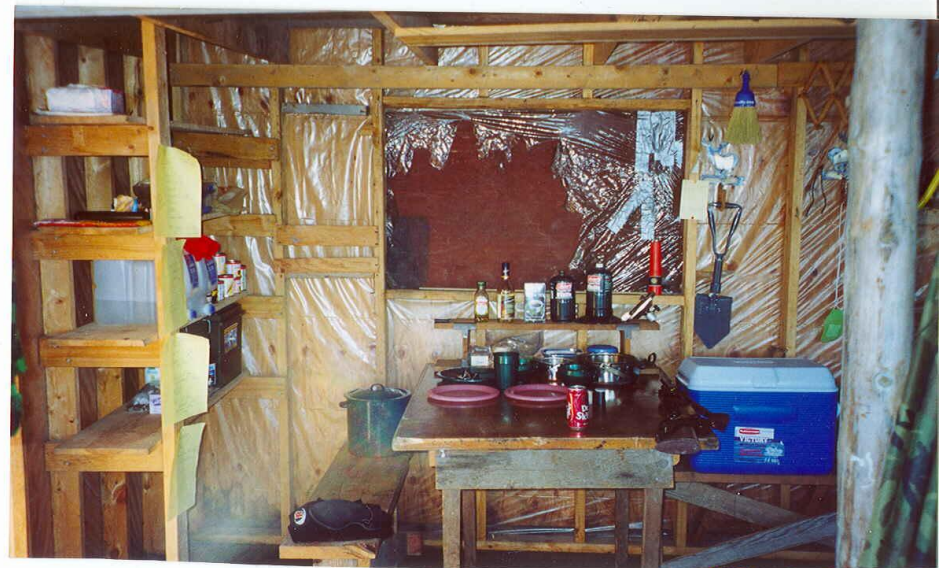
KITCHEN TABLE & SHELVES