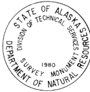
TYPICAL PRIMARY MONUMENT