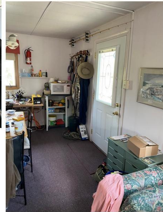
INTERIOR GUEST CABIN