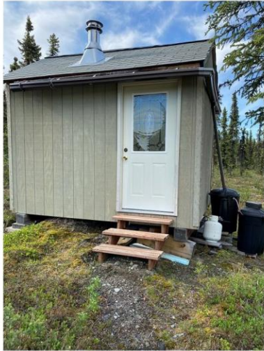
SAUNA / SHOWER BLDG