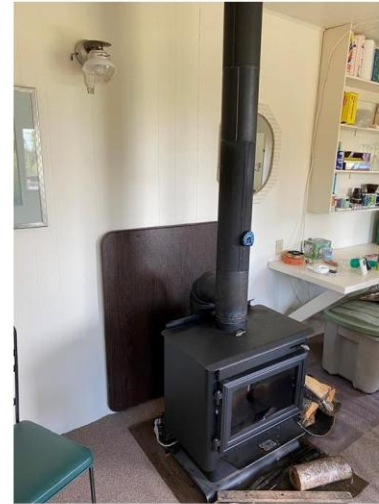
MAIN CABIN INTERIOR